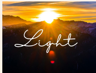
“Light” from Corinne