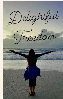
“Delightful Freedom” from Janell